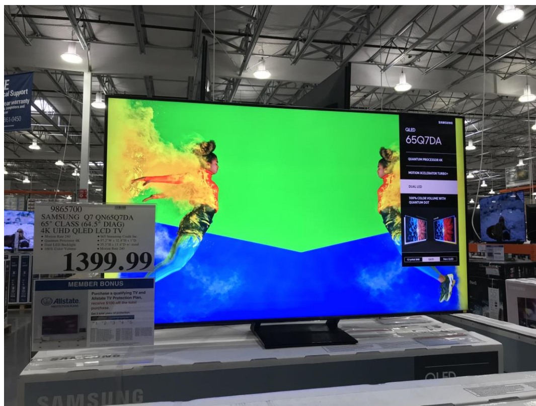
Figure 1. Samsung QN Series TV with Mini-LEDs

In the near future, the company will show ramping sales on mini-LED technology. O2Micro start by booking sales to tablet manufacturers and then move to the TV business. Management believes the mini LED business will be a "major, major growing business over the next five years." This technology is the future and ultimately all monitors and TVs will be built using mini-LEDs. O2Micro is the leader in this and is currently working with Japanese and Korean pioneers on designs.